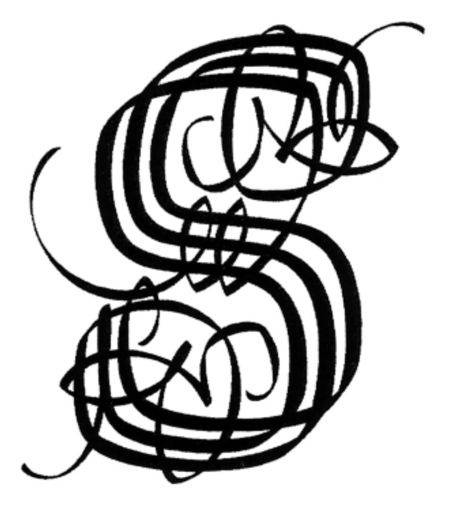
'modern' — Raffia