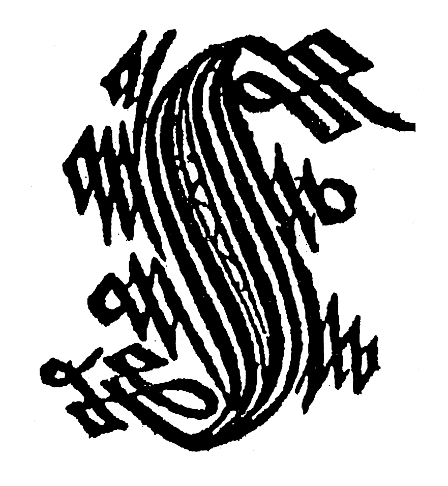
lettres cadeaux / cadels / pen-drawn initials — 'old style' — the generic norm

raffia has affiliations with these letterforms, but deviates from the 'old-style' (and 'transitional') pattern of construction and elaboration.