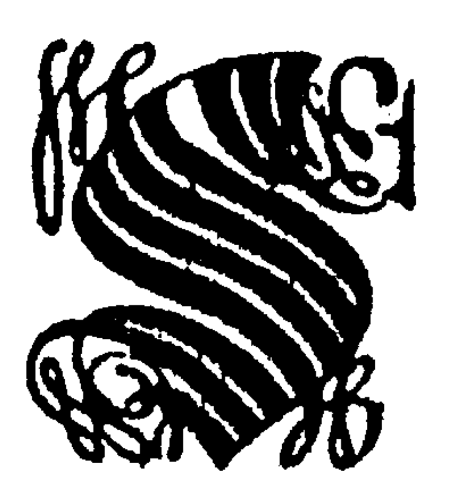
'transitional — the Alkmaar S